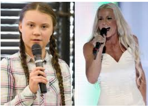
Greta with her mother

I am sick and tired of this Greta Thunberg, the child of 16 from Sweden who stands up in front of people and tells them that the Earth is going to auto destruct in a few years. I consider this the most cynical and deliberate PR campaign on the half of those behind-the-scenes who stand to make a lot of money from irrational fear about so-called climate change. The golden rule is "follow the money". Who stands to benefit from this? Those who trade in carbon credits.